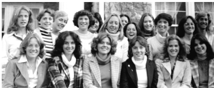
The LSMs on the veranda, 1977 or 1978

Times have changed, and pledging Greek is not what it used to