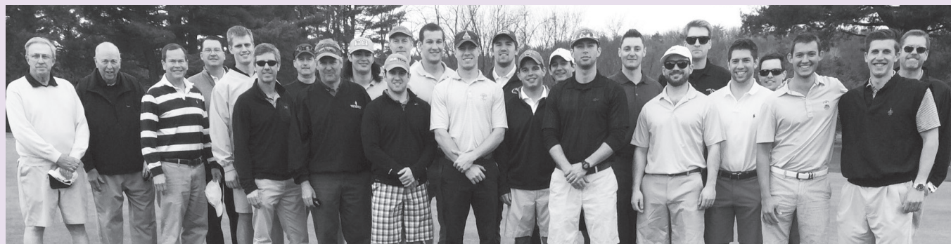
Brothers enjoyed a day of golf at Toftrees in State College this past spring. Will you be part of next year's golf outing, June 20?

Come back this fall for Homecoming, September 27 (details on page 1 and at www.saepsu.com ). And be sure to mark your calendars for our next golf outing, Saturday, June 20, 2015.