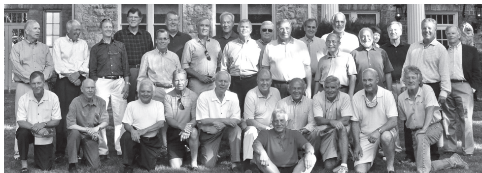
An impressive group of brothers from the 1960s and 1970s has set the standard for what it means to stay connected at SAE. Next up: 1980s and 1990s ... time to start planning now!

Discussions are underway for another reunion in a year or two. In the meantime, go to www.saepsu.com for more photos from the weekend.