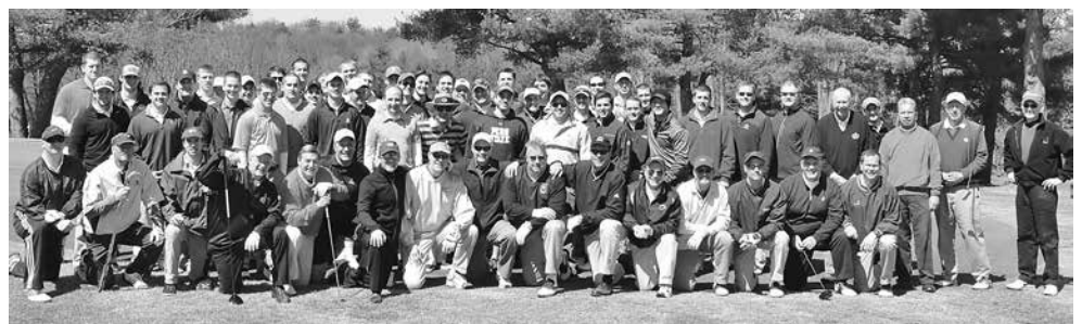
Alums, actives, and parents of actives pause for a group shot at this year's golf outing in April

With the giving year nearing a close in September, I am proud to announce that we are on track to hit last year's fundraising total of just over $14,000, with an amount-to-date raised of $12,900. I urge all of you to please make a gift, as every bit of your donations go toward maintaining the alumni communications program and the undergraduate chapter. Without the alumni communications program, the multiple events throughout the year that provide opportunities for each of you to connect with one another would not be possible. Let's not let our relationships fade—brothers for life.