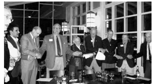
Founder's Day 2013

These repairs will be done in time for Homecoming 2013, our next major alumni