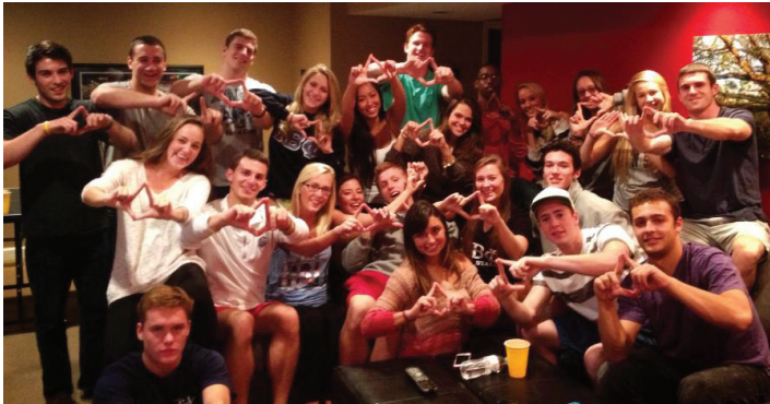
SAE and Pi Phi members during a fall weekend canning trip.

It's been a busy fall for THON as well. We dedicated three weekends to canning including joint SAE-Pi Phi trips to Philadelphia,