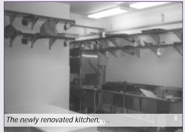
The newly renovated kitchen, ...