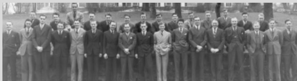
Where are they now?

Your financial support of the chapter is critical to the success of our relaunch. Detailed financial reports are available upon request.