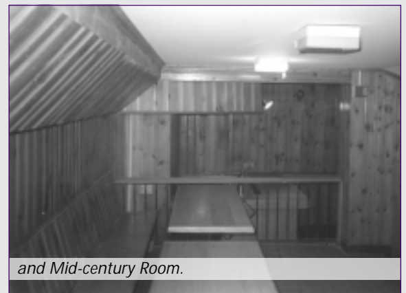
and Mid-century Room.